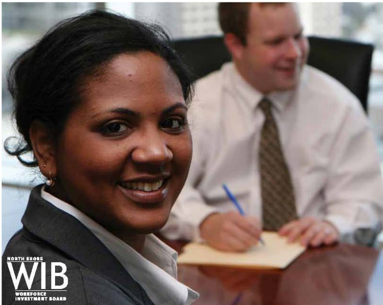
North Shore Workforce Investment Board